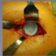
It's not possible to see the femoral head and acetabulum in the same picture. In this picture, the femoral head is visible. In the next picture, the acetabulum is visible. The femoral head is not visible in the next picture.