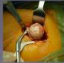
It's not possible to see the femoral head and acetabulum in the same picture. In this picture, the femoral head is visible. In the next picture, the acetabulum is visible. The femoral head is not visible in the next picture.