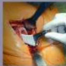
It's not possible to see the femoral head and acetabulum in the same picture. In this picture, the femoral head is visible. In the next picture, the acetabulum is visible. The femoral head is not visible in the next picture.