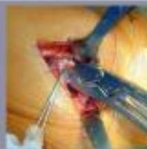
It's not possible to see the femoral head and acetabulum in the same picture. In this picture, the femoral head is visible. In the next picture, the acetabulum is visible. The femoral head is not visible in the next picture.